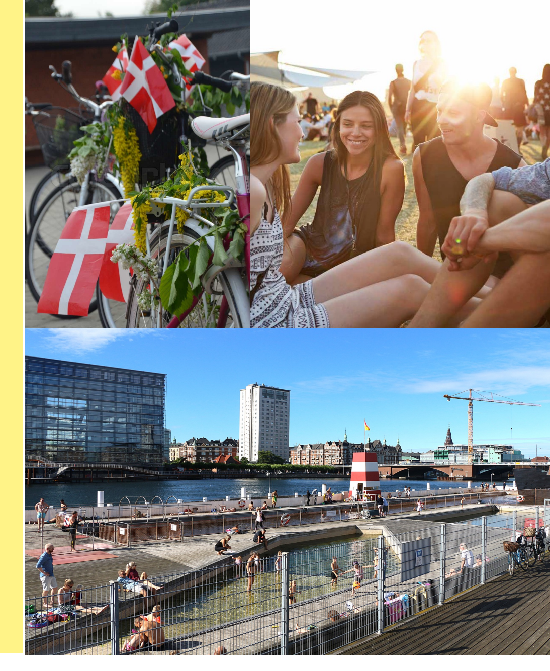
Academy of Technologies and Business

Train lines run between the different regions. You must have a valid ticket or commuter card when using public transportation, as the fines for riding without one are high in all cities.